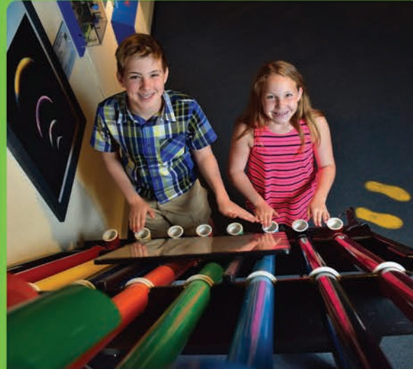
Make music on the Pipes of Pan

Don't forget to take a selfie with our giant Robot that lives right here at the Tommy Bartlett Exploratory!