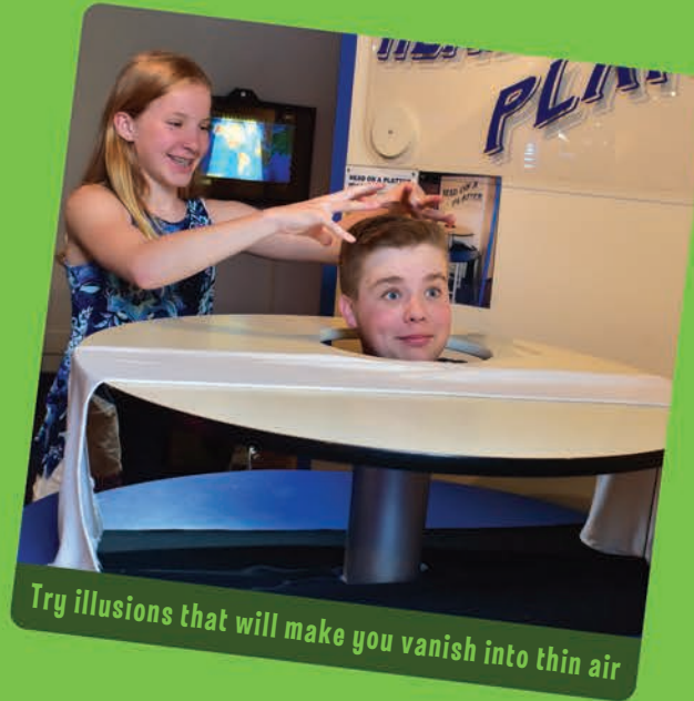
Try illusions that will make you vanish into thin air

All day, every day, the Tommy Bartlett Exploratory is the place for interactive excitement. Once you enter the Exploratory, you're sure to get lost in space, science, technology and fun!