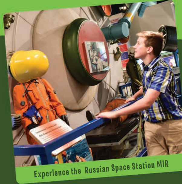
Experience the Russian Space Station MIR

TOMMY BARTLETT EXPLORATORY INTERACTIVE SCIENCE CENTER