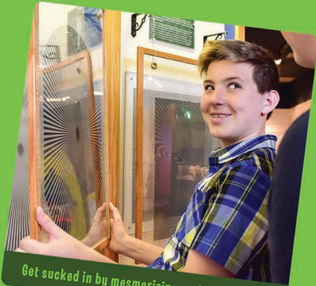
Get sucked in by mesmerizing optical illusions