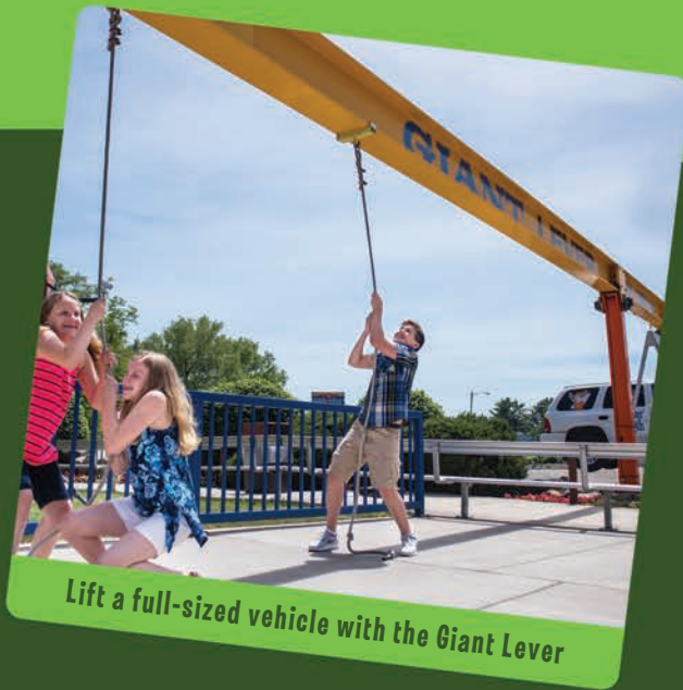
Lift a full-sized vehicle with the Giant Lever