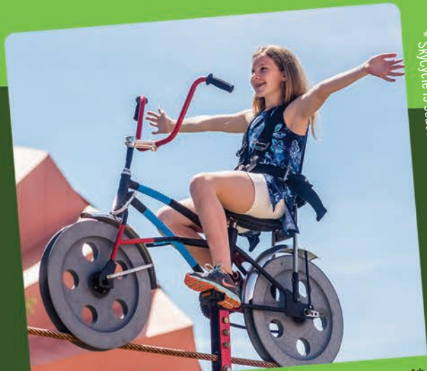
* SkyCycle is seasonal.