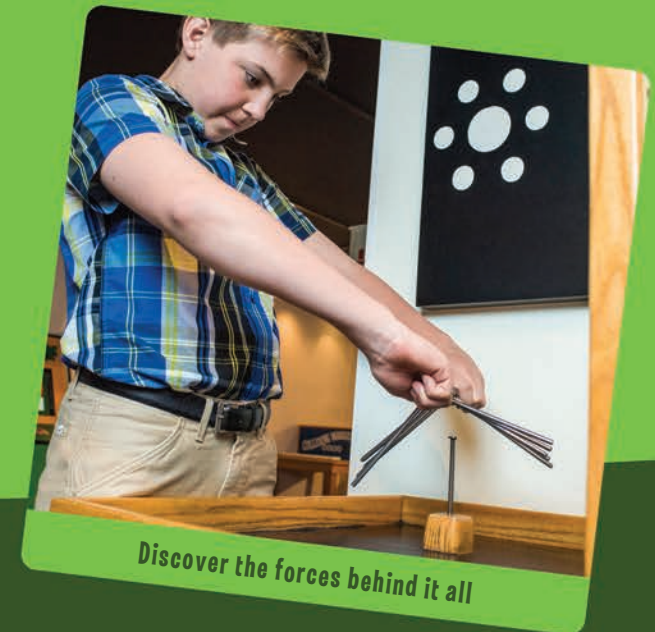
Discover the forces behind it all